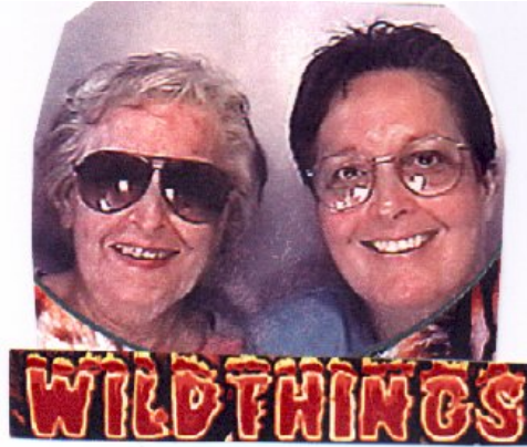
America’s Most Wanted – Beware they may be dangerous!