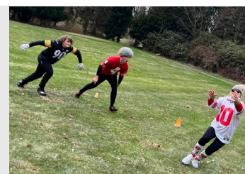
Marieta is open!