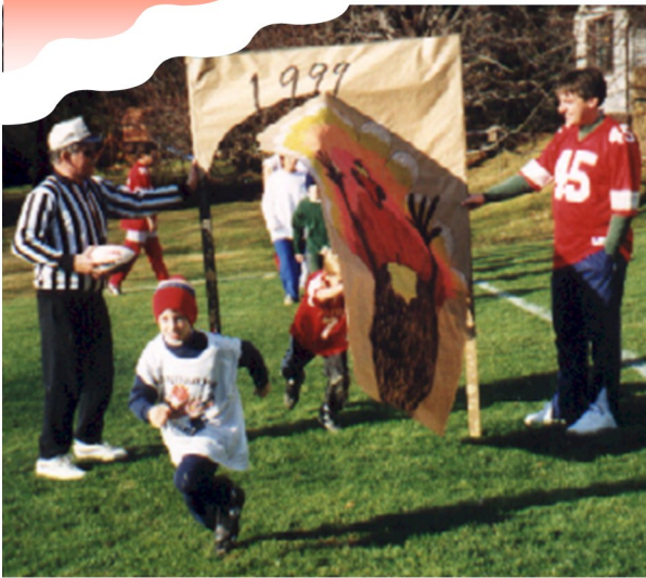
The Young Bucks were ready to tear up the field last year.