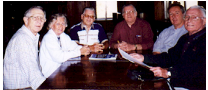
Silver Bucks in strategy meeting at Oglebay Park, Wheeling, WV