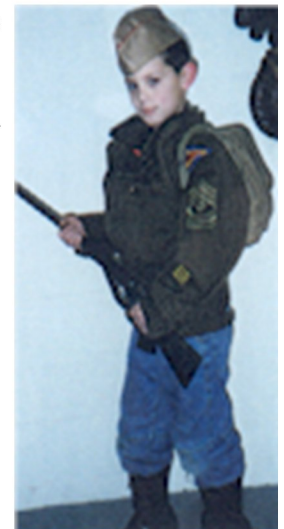
"Not across our goal"