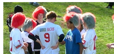
Young Bucks offensive huddle—How can we score on this Silver Defense?