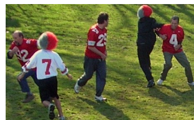
Silver Bucks attempt one of their 20 passes.

The half ended in controversy when on 5th down, the last play of the half, the Youngs tried some