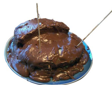
Cake baked by newly appointed executive chef.

fresh thyme will find its way into the green beans, and no imported aged English cheddar will be used in the cheesy potatoes. I will use the original recipes and cook them in the traditional manner.”