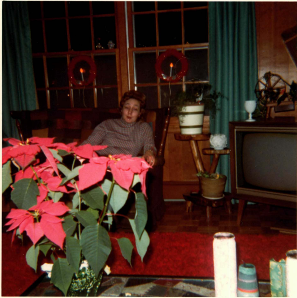
Then to the D.S.'s the 29th