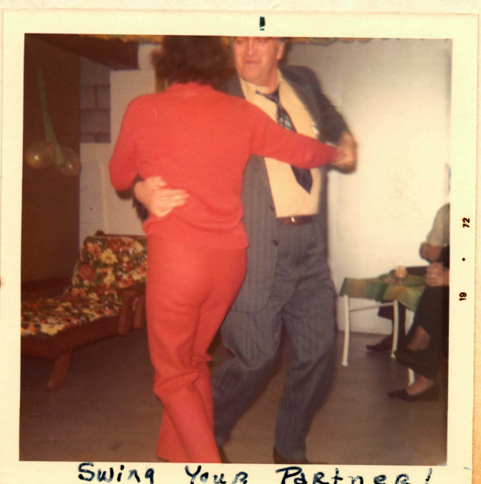
Swing Your Partner!