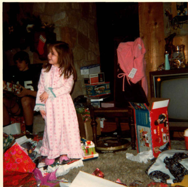
Like my new nightgown?