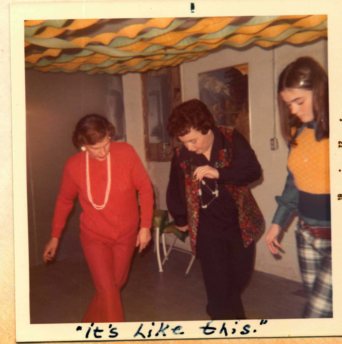
"it's like this."