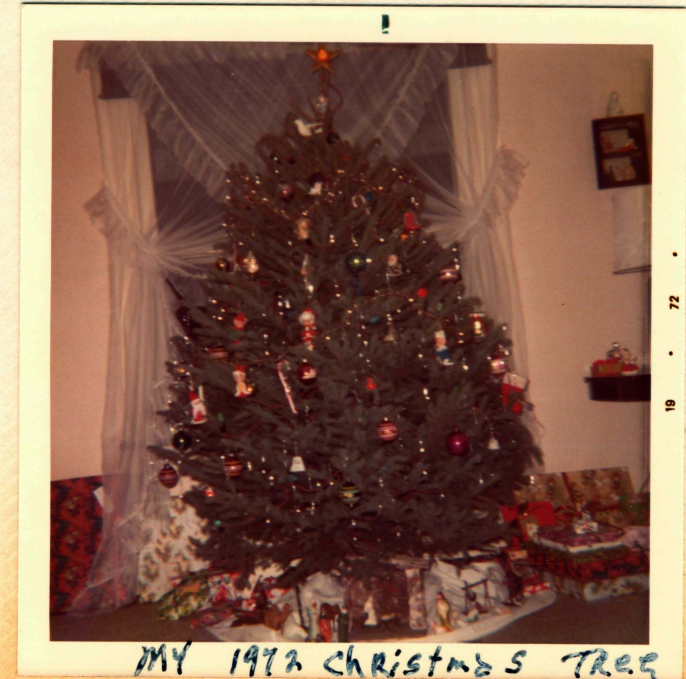
MY 1972 CHRISTMAS TREE