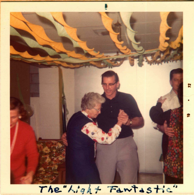
The "light Fantastic"