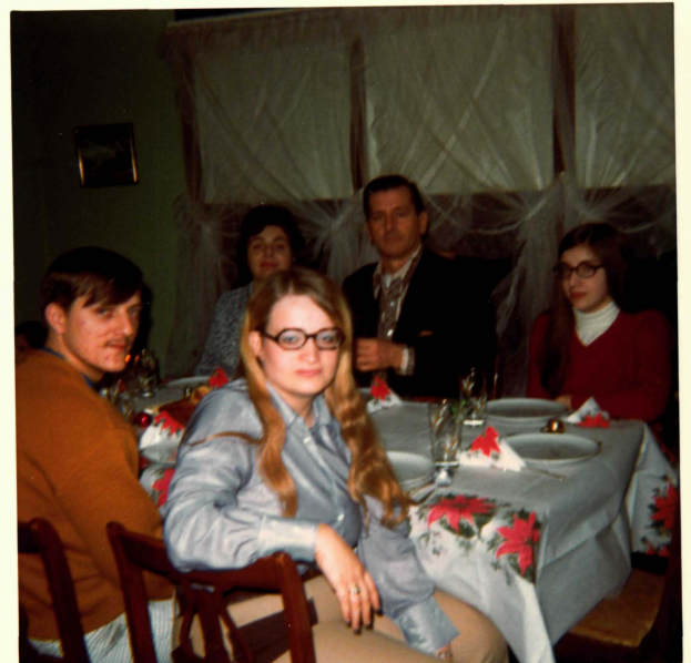
To Grover's Christmas Night