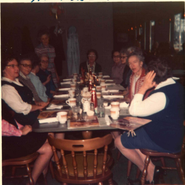
Oct. Birthday Luncheon