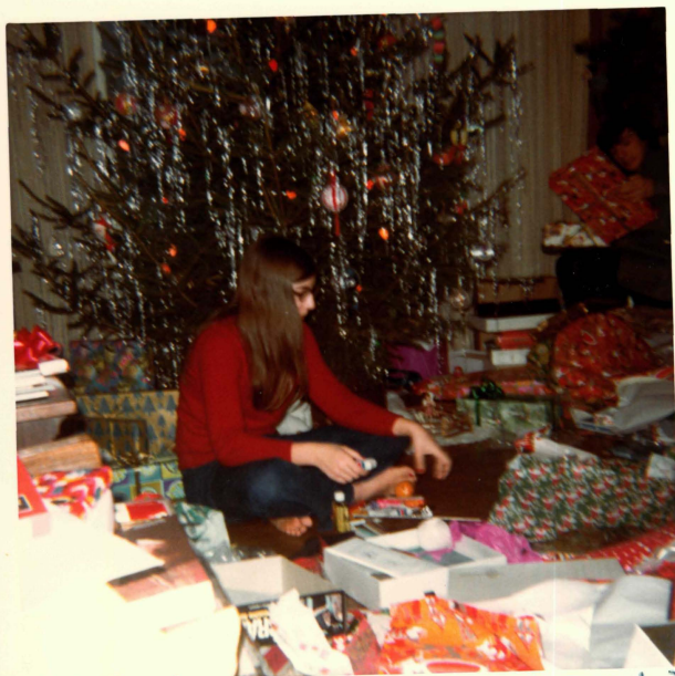
Which shall I open next?