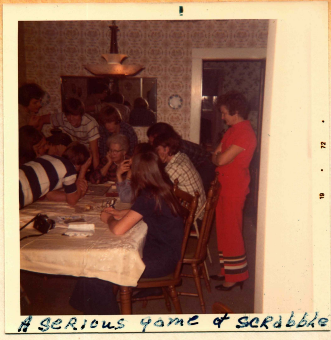
A SERIOUS game of scrabble