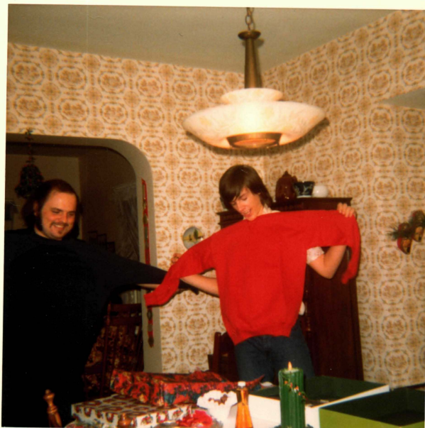
T-shirts From the C.R.'s