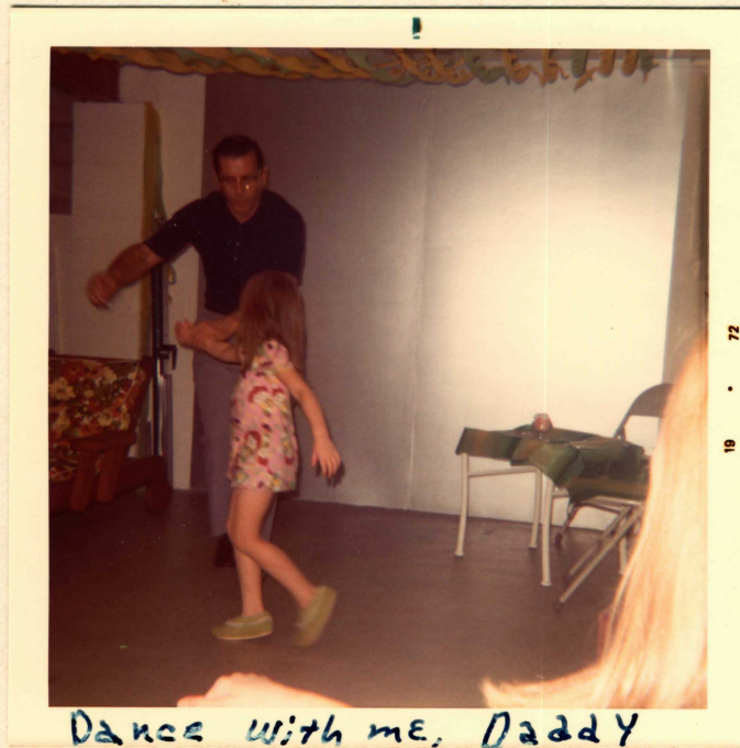
Dance with me, Daddy