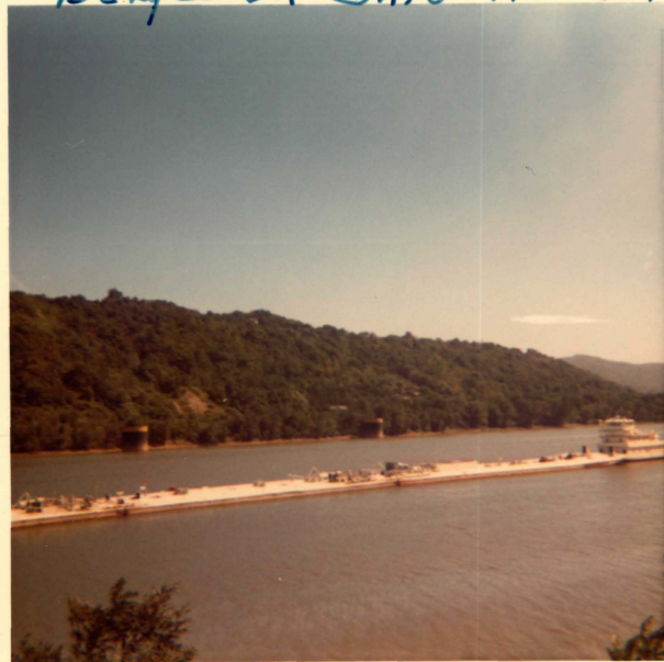
Barge on Ohio River