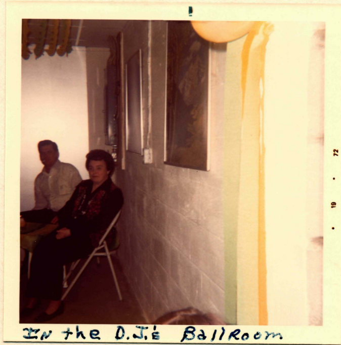
In the D.J.'s Ball Room