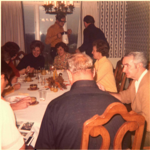
Nov. 12 '72