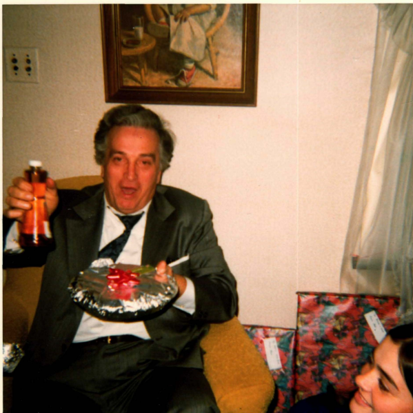
O, Boy - Mince Pie + Rum Sauce