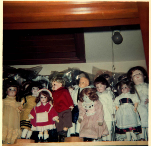
More Dolls - M.K.'s