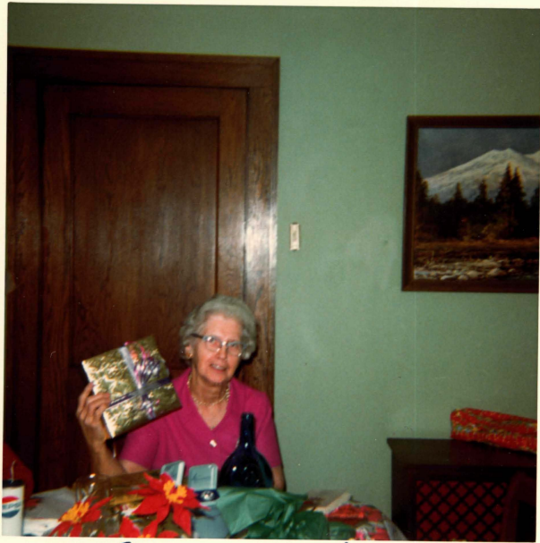
Santa was here, too.