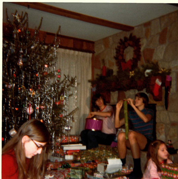
Bruce got a Dream??