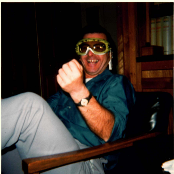
The Blue Baron?