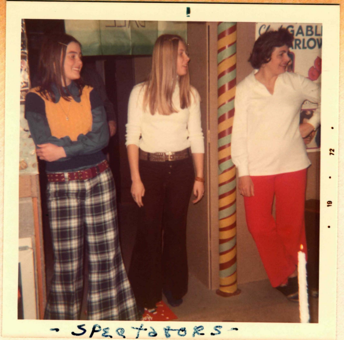
- Spectators -