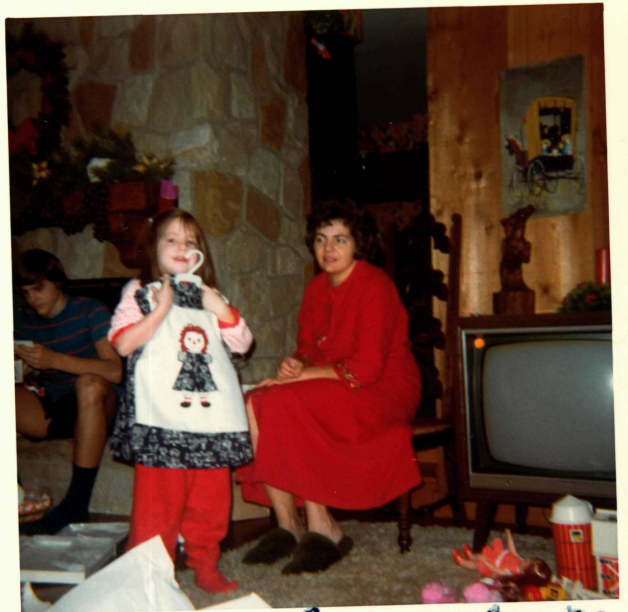
And a Raggedy Ann Dress