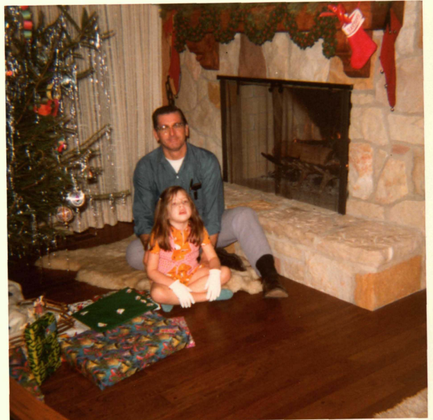
Chr. Eve - waiting for Santa