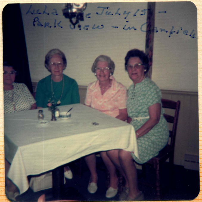
Luha July 15 - Park View - in Campfield