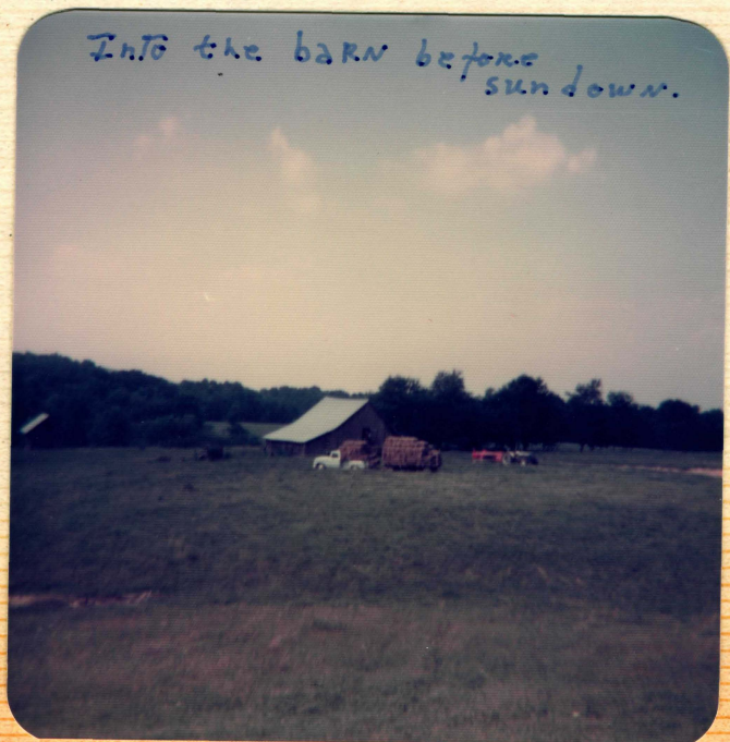
Into the barn before sundown.