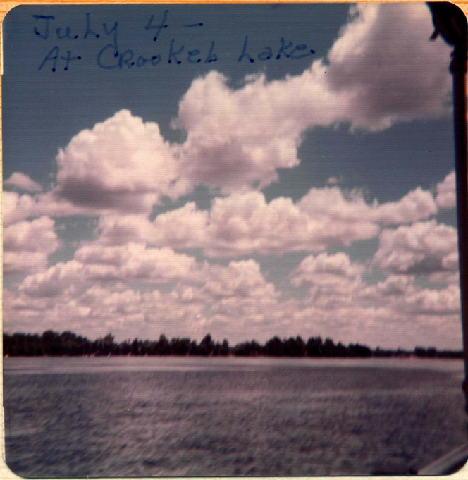
July 4 - At Crooked Lake.