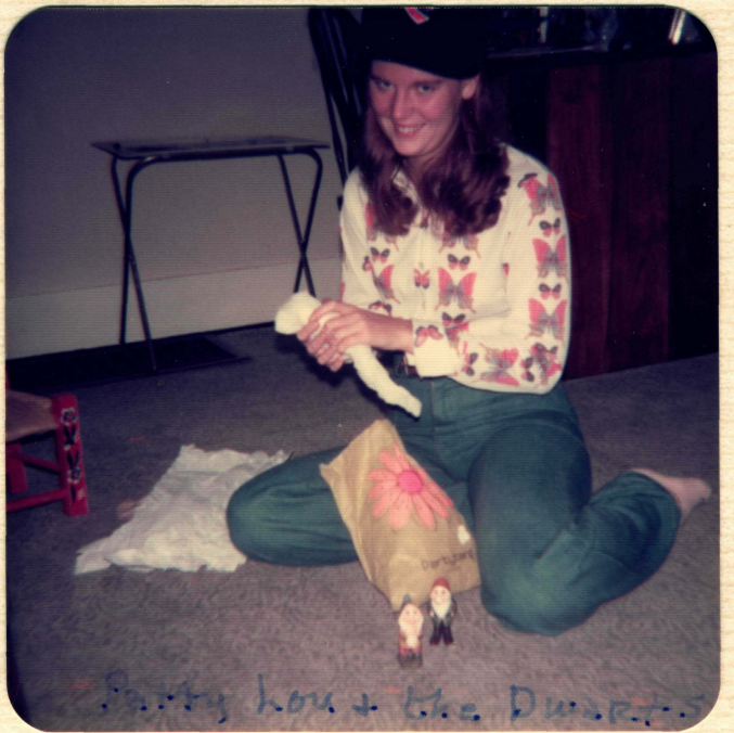
Party hour + the Dwarfs