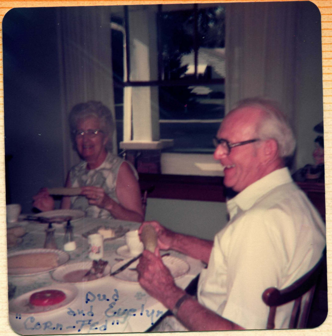
Dud and Giggly "Corn-Pod"