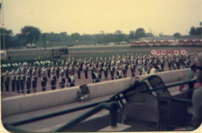
P.H.S. Band at Cantfield Fair No. I