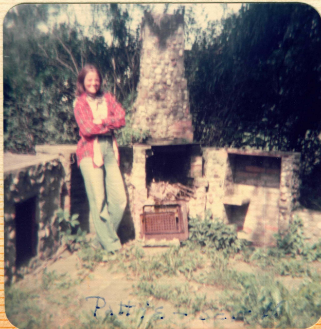
Party's - same as