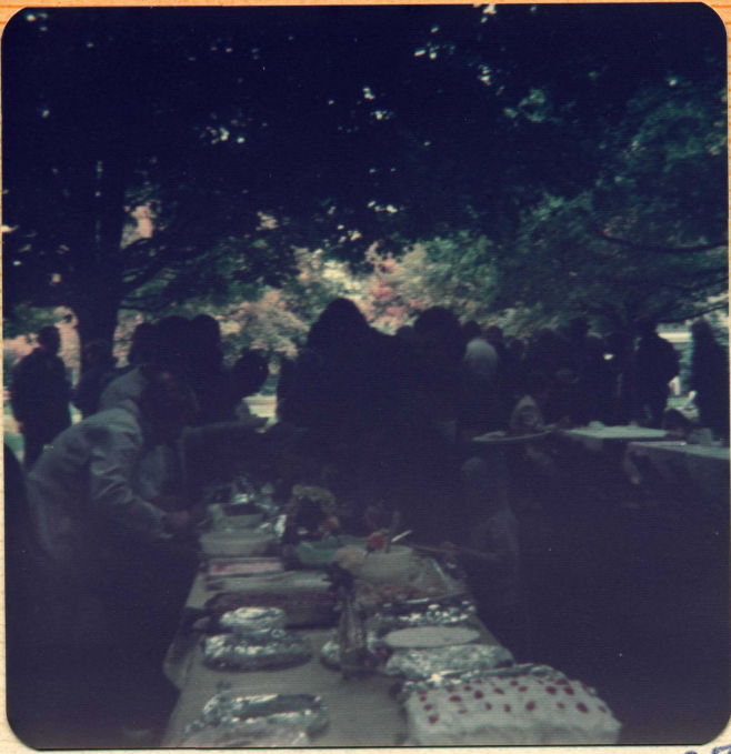
STREET Picnic - Sept. 27