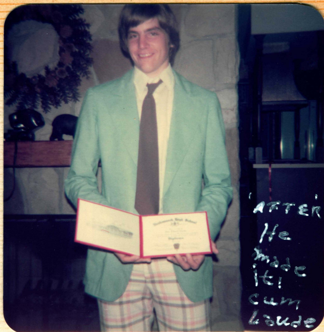
'After' He made it! cum laude