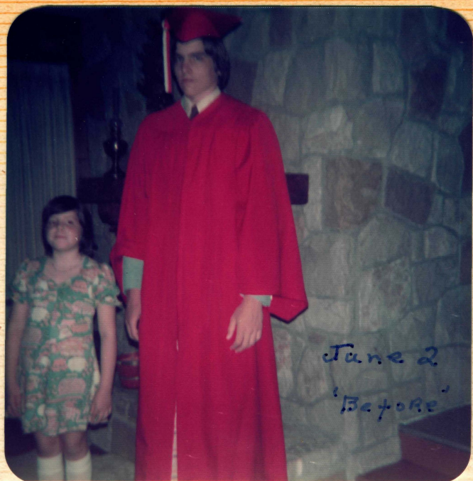
June 2 'Before'