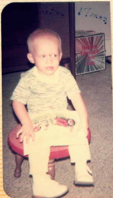
17th Morton Fabrick Hon Stags