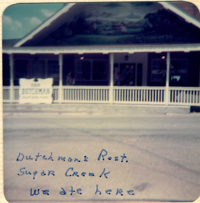
Dutchman's Rest. Sugar Creek we ate here