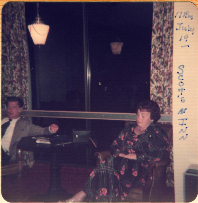
11th July 19 1 Sutton at H.R.