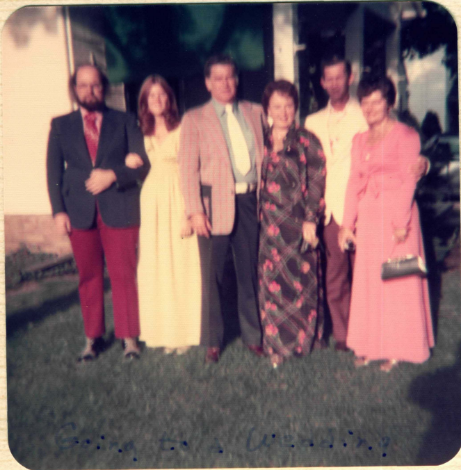
Going to a Wedding