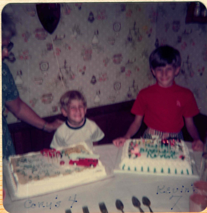
Cony's 4 Kevin's 7