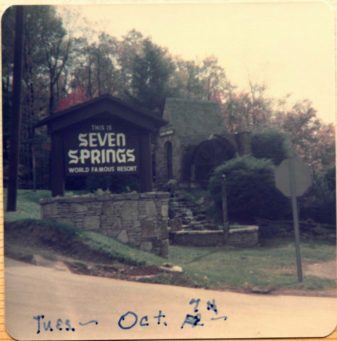
Tues. - Oct. 2 nd