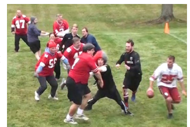
The game is won in the trenches. Turkey Bowl XXXV featured two strong defenses.