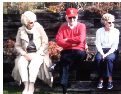
Nicolls Stadium—Cheap Seats