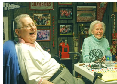
What about Bingo!?