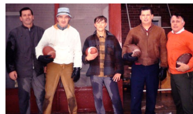
1st Game at Nicolls Stadium