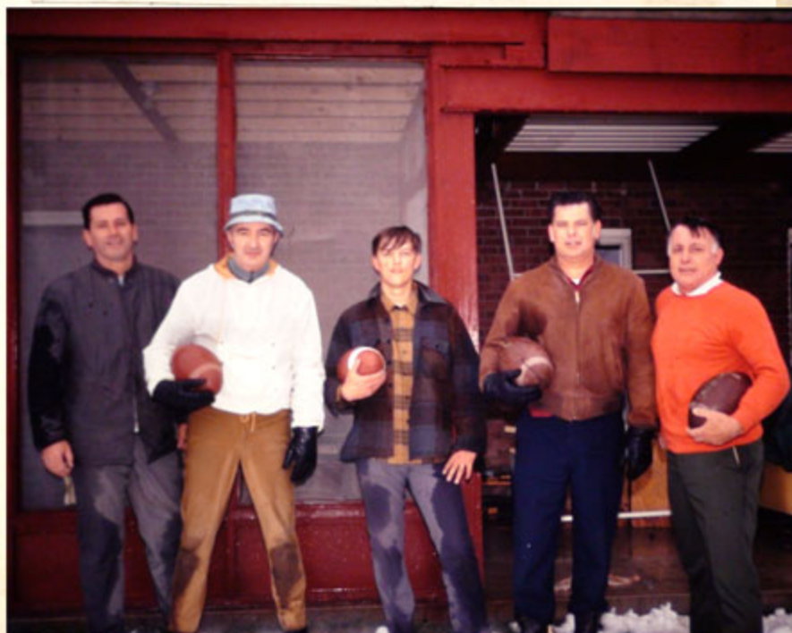
The Over-Forties were wet but not washed up.

The snow wasn't the only surprise for the Young Bucks as the Over-Forties engineered a come from behind victory on that Saturday morning in possibly the greatest game of the series.