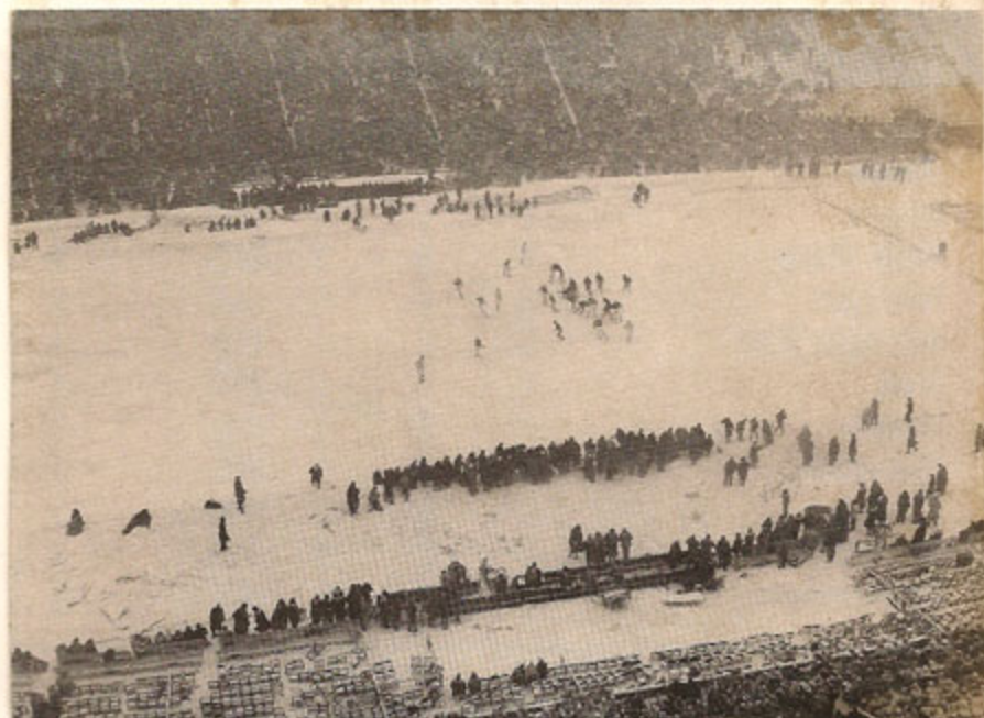
The grounds crew did all they could but Nicolls stadium was still covered with snow.

The Young Bucks gradually became more and more concerned about the condition of the playing field. In no time a grounds crew was organized and started making large snow balls to clear off the field. Working under the lights at Nicolls Stadium the crew managed to deposit four or more gigantic snow balls in the south end zone. But the effort was more fun than effective because the field was too large and the snow too plentiful. The Young Bucks were hoping that the snow would be gone by the next morning but everyone knew that this was not likely. The big game would be played on a snow covered field the next day.