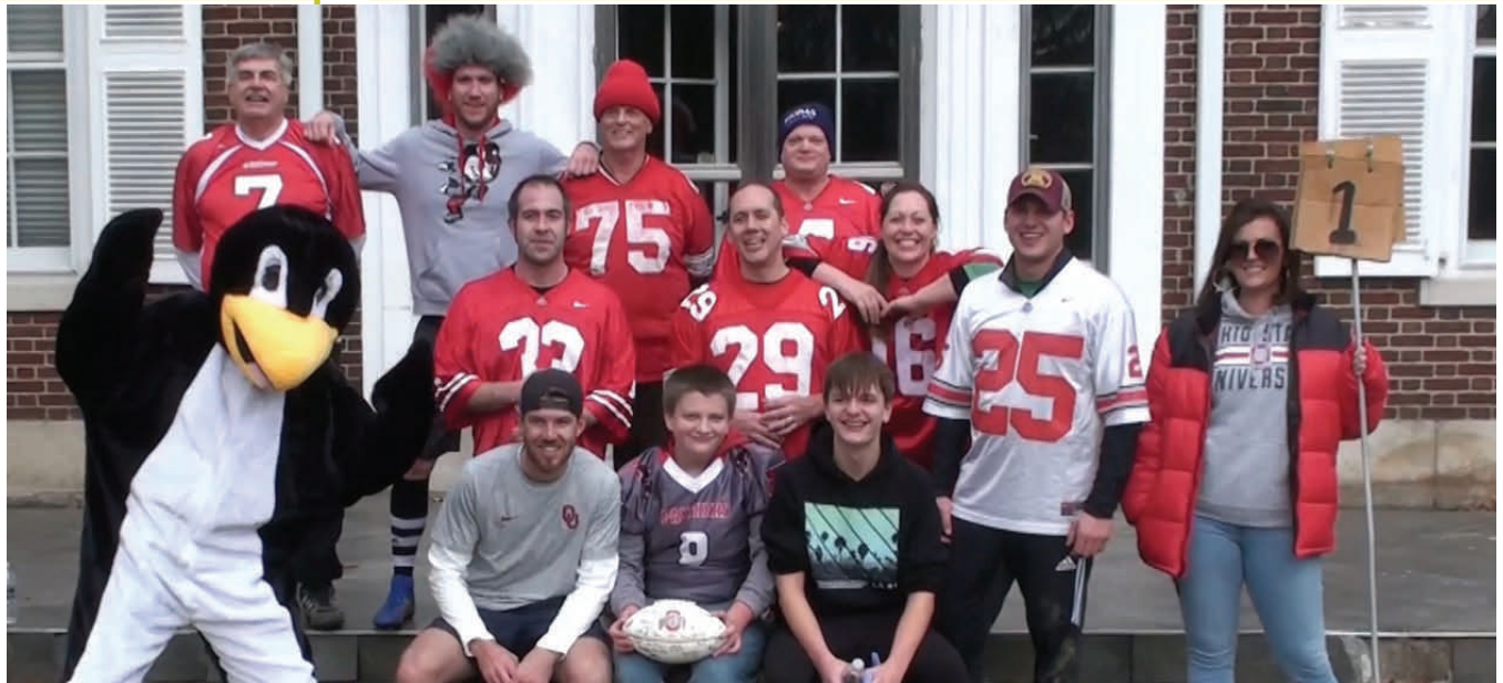
Turkey Bowl XXXVI Team Picture—The Young Bucks prevailed over the Silver Bucks. The accountants are still tallying the score.

Turkey Bowl XXXVI was played at a new venue— the Pines Lake Club Mansion