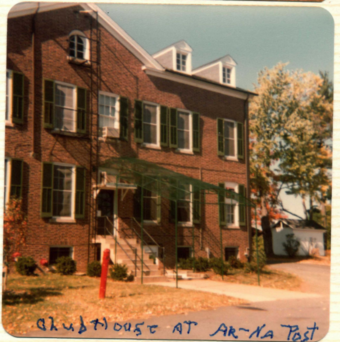
Clubhouse at Ar-Na Post