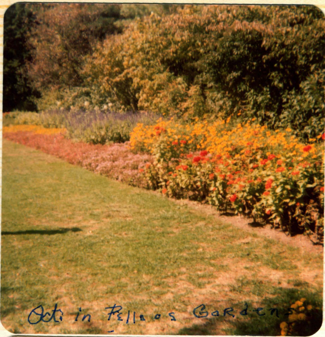
Oct. in Fella's Gardens