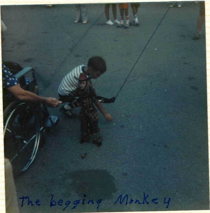
The begging Monkey