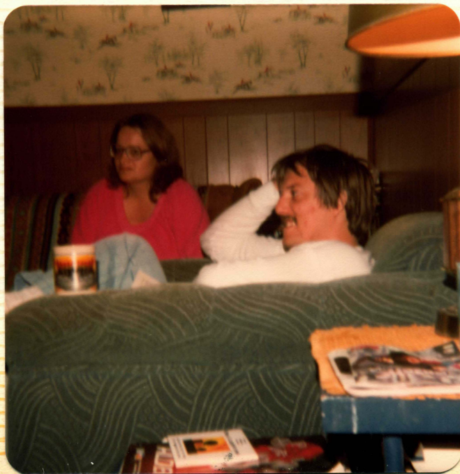
AT FELLOWS GARDENS