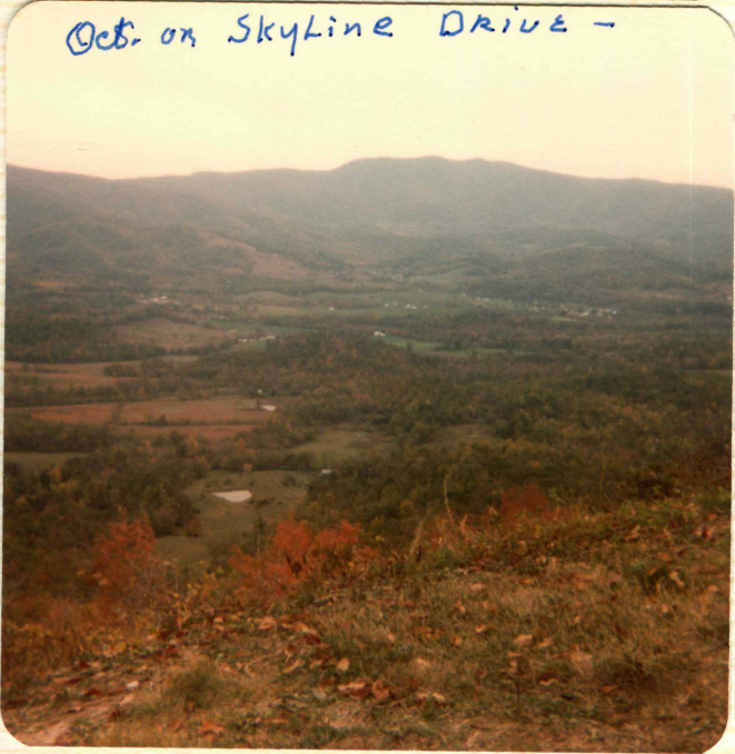
Oct. on Skyline Drive -