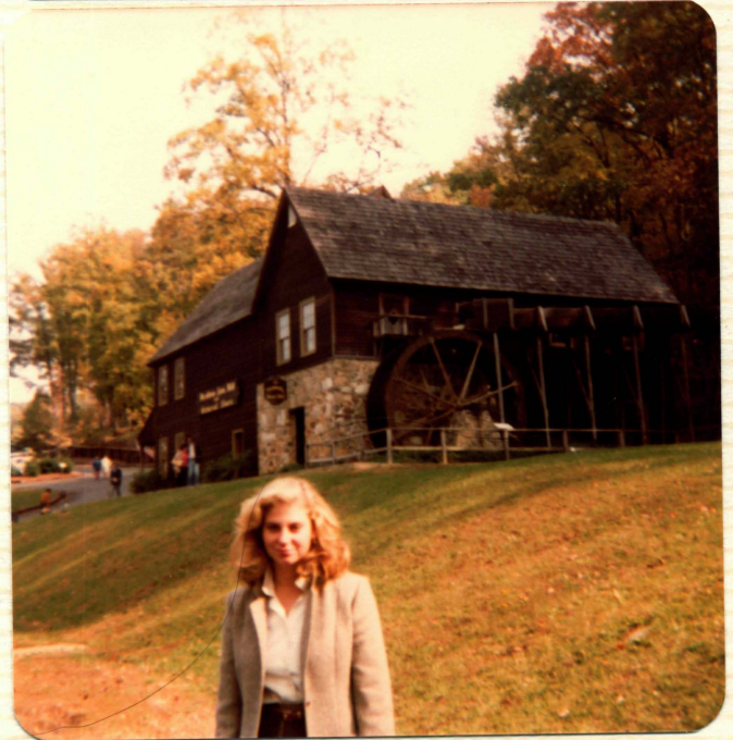
View from Michie Tavern