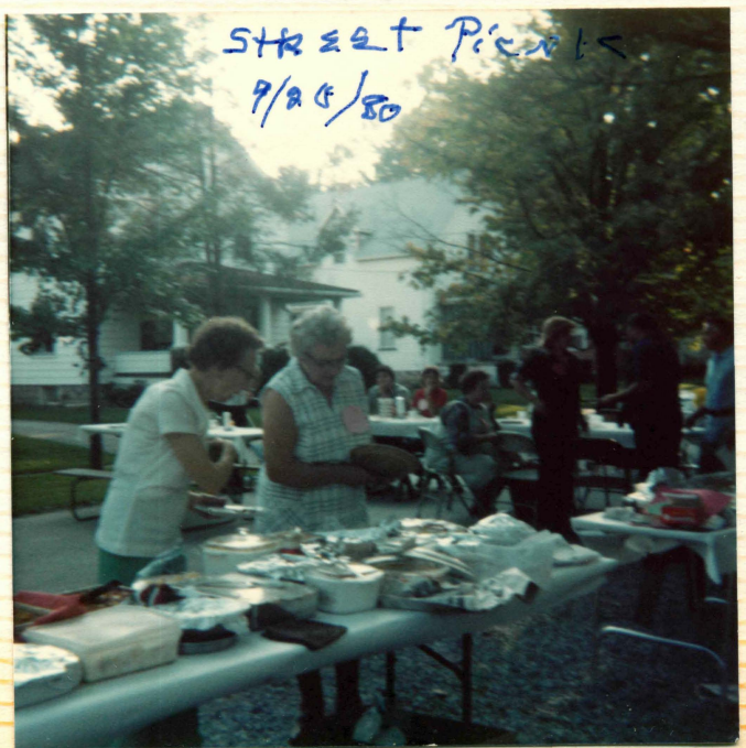
Street Picnic 9/25/80