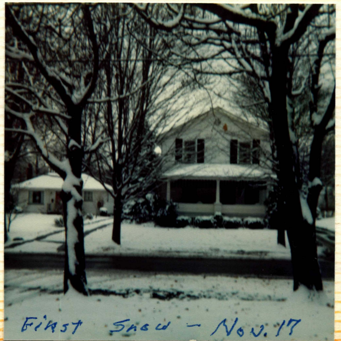
First Snow - Nov. 17