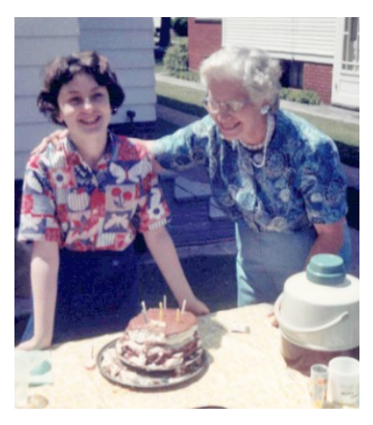
Memorial Day Weekend in Toledo at the EJs, 1964