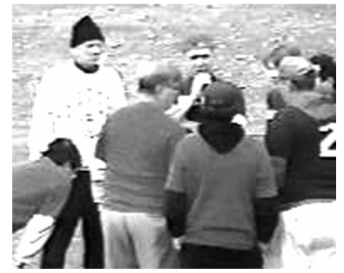
THE 1995 SILVER BUCKS