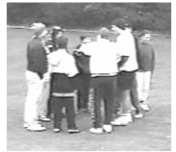
THE 1995 YOUNG BUCKS