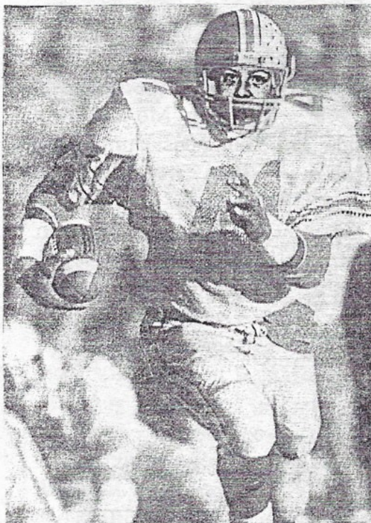
Skin' Ian skates around the right side of the Silver Buck defense.