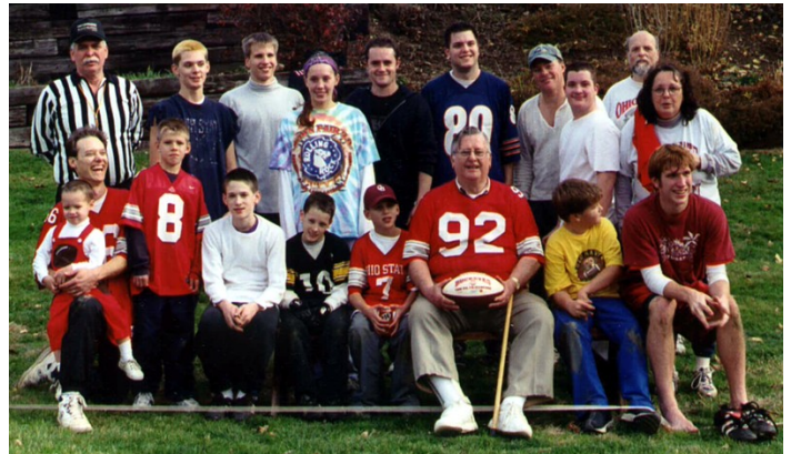
Turkey Bowl XIX Team Picture.

10:30 A.M. Kickoff will be at Nicolls Stadium on Saturday, November 30, 2002 in New Castle, PA. The game will be covered by NSN Plus (the Nicolls Sports Network).