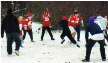
Silvers on offense in the second half