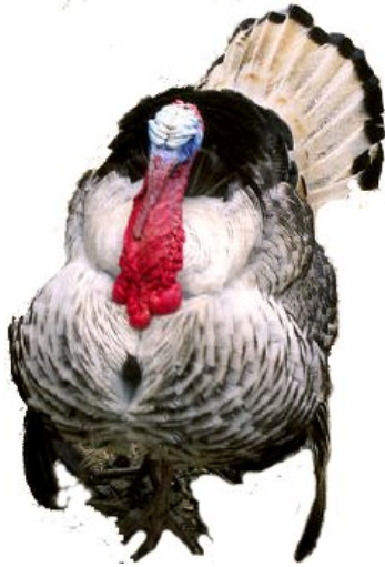
Tom Turkey says, "Eat more Beef."

"He jumped into the Model T, drove down to the North Market in Columbus, bought a live turkey..."