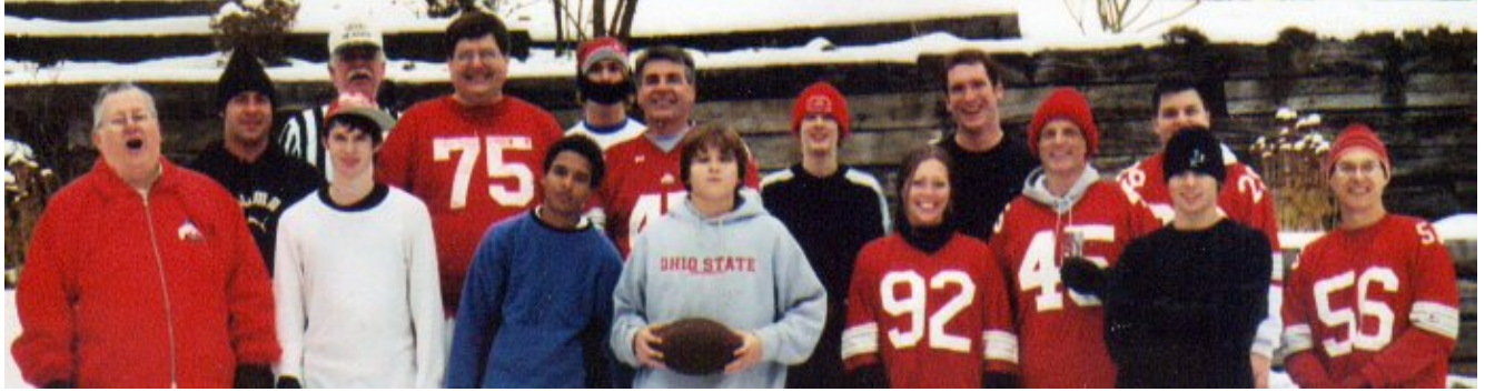
Turkey Bowl XXIII Players, Coaches and Referee