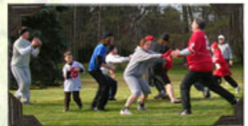
The game is won in the trenches.