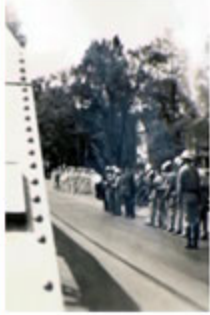
Poland Memorial Day Parade—Salute to Sailors who died in the war.

Each week during school, two of us had lunch with Grandpa and Grandma. I remember her great homemade tomato soup, sugar cookies and angel food cake. When Grandma would pass me the cookie plate, she always turned the plate with the smallest cookie facing me. After a few reprimands for reaching over the plate for a larger cookie, I learned to take the cookie closest