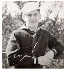
1943—Uncle Dave served in the Navy on the USS Philadelphia in the European Theatre.