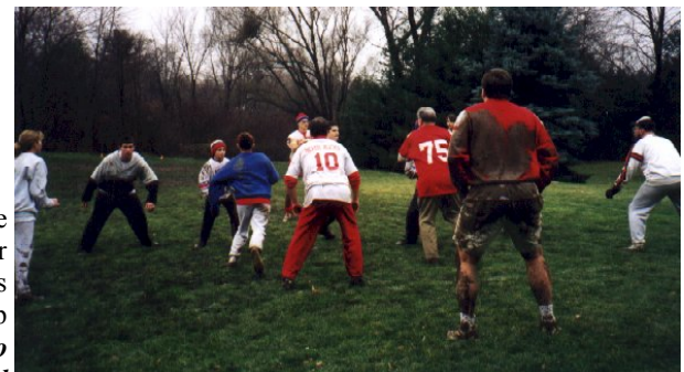
Emotions ran high in Turkey Bowl XV – the closest game yet.

tions. The Silver Bucks picked up Too Small Dale , a great addition to the team.